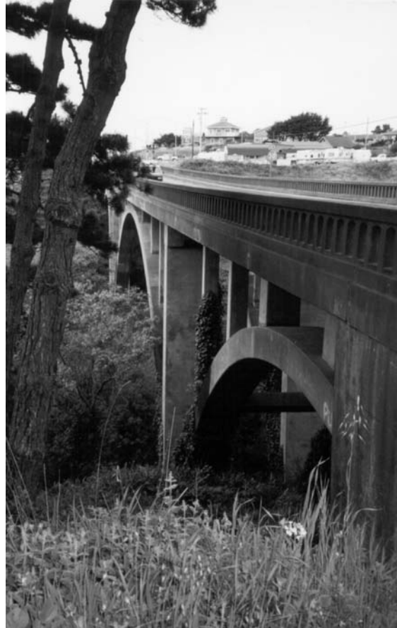
Hare Creek Bridge in Fort Bragg on coastal Route 1.

A number of projects included in the RTP are major road improvements, or improvements to other transportation facilities, so an Environmental Impact Report was required. The EIR discussed the impacts of the projects in general, since the actual impacts cannot be predicted without detailed designs of the proposed