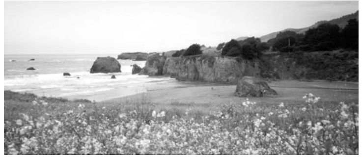
Seaside Creek Beach on the northern Mendocino Coast is a favorite spot of both locals and visitors.